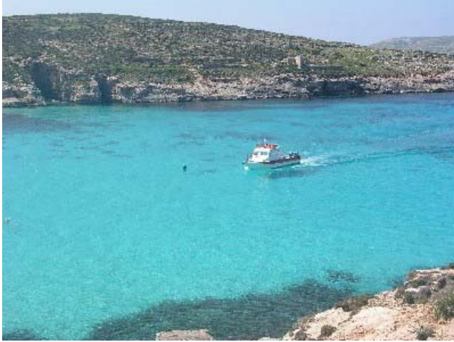
The Blue Lagoon, nice spot for a bit of lunch.

While on the top of the reef I managed to find quite a large stone fish. The only down side with the dive was that the current was quite strong causing a fun surface swim back to the boat. We stopped for lunch at the Blue lagoon, he lain decided to have a swim, he jumped in, turned round swim back to the boat climbed in and muttered something about the temperature before heading over for lunch.