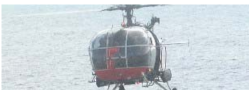
Winched up by an air-sea rescue helicopter: not what you'd call a planned exit from a dive.

[The afternoon did get interrupted by the rescue of two divers in the next cove along the coast. They had somehow managed to get stranded on the top of a stack next to the cliff, surrounded by a long fall and large waves. The helicopter crew successfully recovered both the divers along with all of their equipment... Matt]